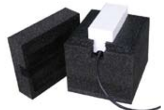
Sensor back Note cable routing