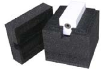
Sensor/Emitter placement in Foam Base