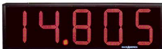
6632E Fifteen Inch Display Timer