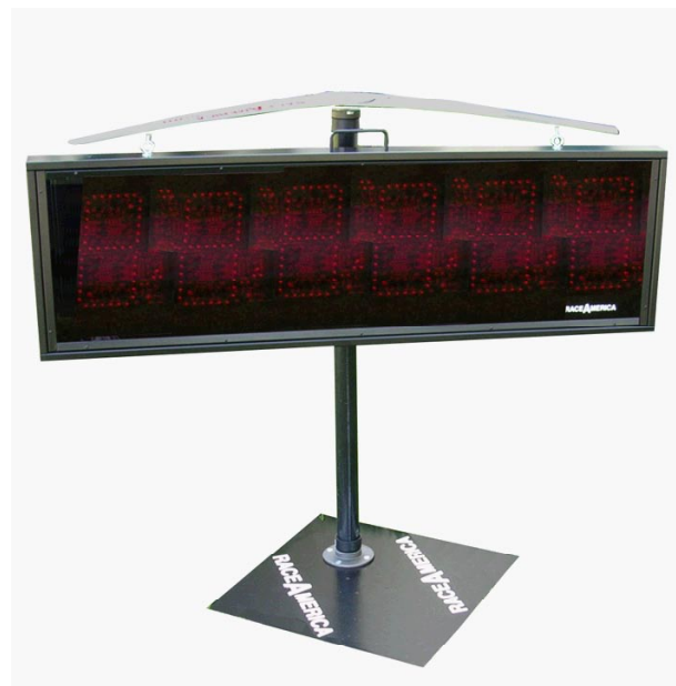
Assembled Suspension Stand